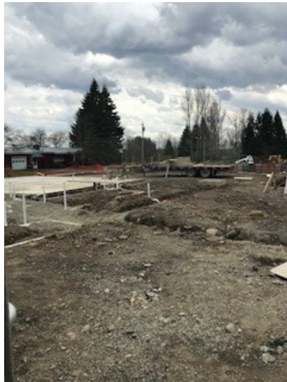
Fellowship Hall Floor