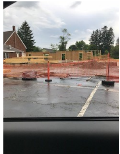
East wall sections (Church Street, looking from the parking lot) 5/31/18