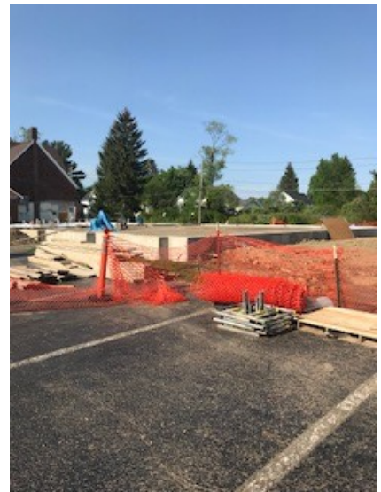
Parking lot view, looking north east 5/23/18