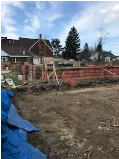
Preparing the site for concrete