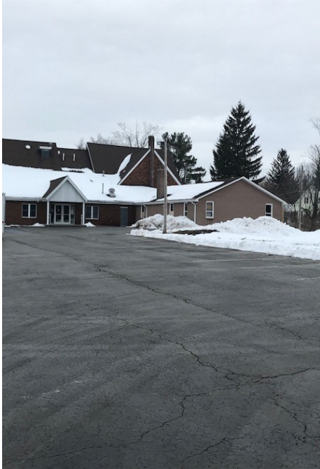
BEFORE March 6, 2018