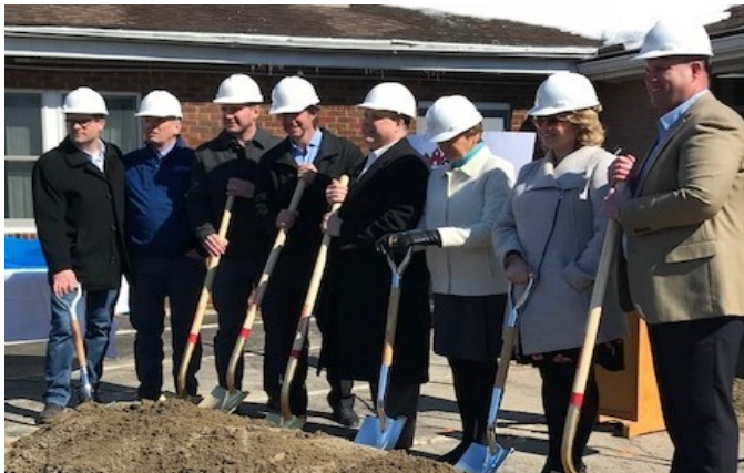
Dignitaries Groundbreaking Service March 25, 2018