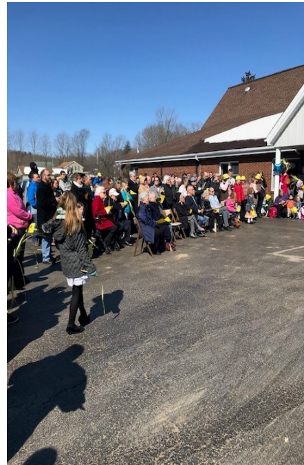
Groundbreaking Service March 25, 2018